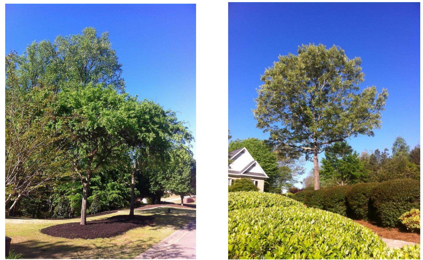
Well-Maintained 'New Growth' & 'Old Growth' Trees with lower limbs removed to allow sunlight to reach the shrubs and lawn.