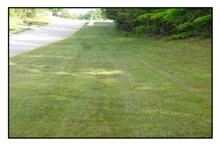
Example: of an undeveloped Lot properly maintained to Royal Lakes Standards.