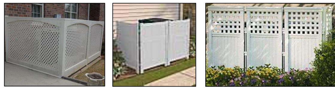
Architectural Screen examples for Trash Containers

A few examples of approved type architectural screens for trash containers are below. Contact the ASC for approval of screens and their intended location on the property.