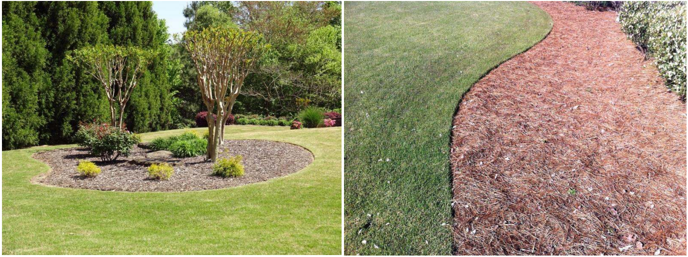
Well-Maintained: Lawns & Islands